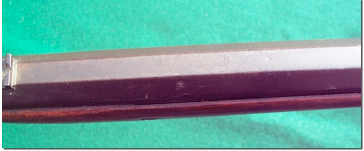
Early Samuel Baum Rifle showing a strong Lehigh Valley influence ca. 1800. Notice how the stock differs from the Dreisbach and Kolpitzer rifles shown

From these pioneers of old Union County gunsmithing, a plethora of gunsmiths spread into many local communities and indeed to many other counties and states. Thus the legacy of their training spread far beyond the shops where they plied their trade. In an effort to show the scope of their importance, the following list of local communities and smiths known to have worked in each is shown. Note that some smiths worked at various times in different communities and therefore show up multiple times on the lists. No attempt is made to identify who trained them, but it must be assumed that many learned their trade from the smiths already identified or from a second generation